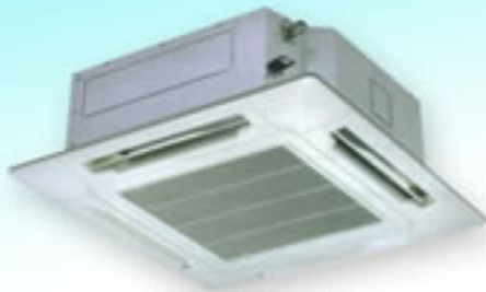
SEMI-CONCEALED TYPE 4-WAY AIR DISCHARGE