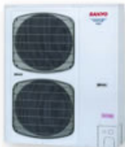
MINI ECO-I SERIES (4.5, 6 HP)