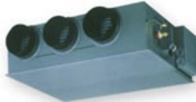
CONCEALED DUCT TYPE