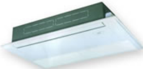
SEMI-CONCEALED SLIM TYPE 1-WAY AIR DISCHARGE