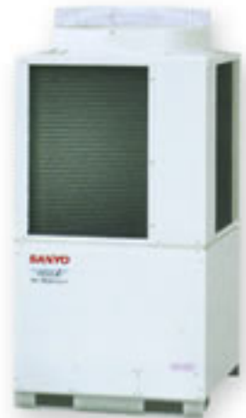
2 & 3 WAY ECO-I (8-48HP)