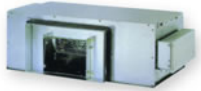
CONCEALED-DUCT HIGH-STATIC PRESSURE TYPE