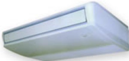
CEILING MOUNTED TYPE