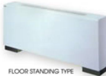
FLOOR STANDING TYPE