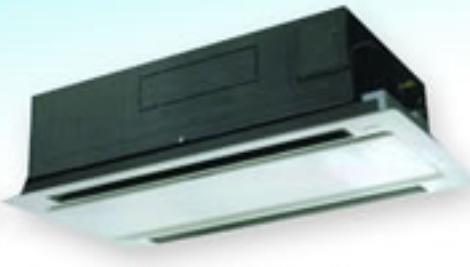
SEMI-CONCEALED TYPE 2-WAY AIR DISCHARGE