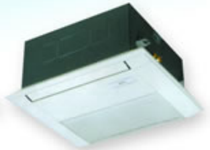
SEMI-CONCEALED TYPE 1-WAY AIR DISCHARGE